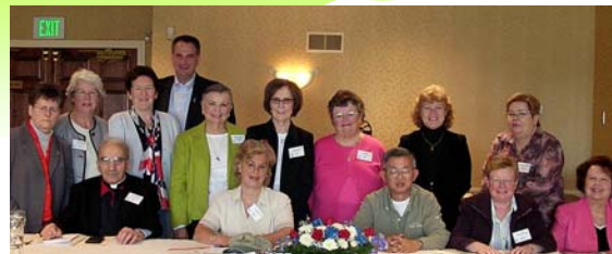
Executive Board of Directors 2005