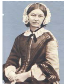
Florence Nightingale Founder of modern nursing

It was normal that Catholic nurses should continue through the centuries this attitude of charity bringing in it, with the technical knowledge required today by the scientific progress, the same deep ideal of respect and love for man. It is only normal that they should group to think together, support and stimulate this ideal in the light of Christian principles.