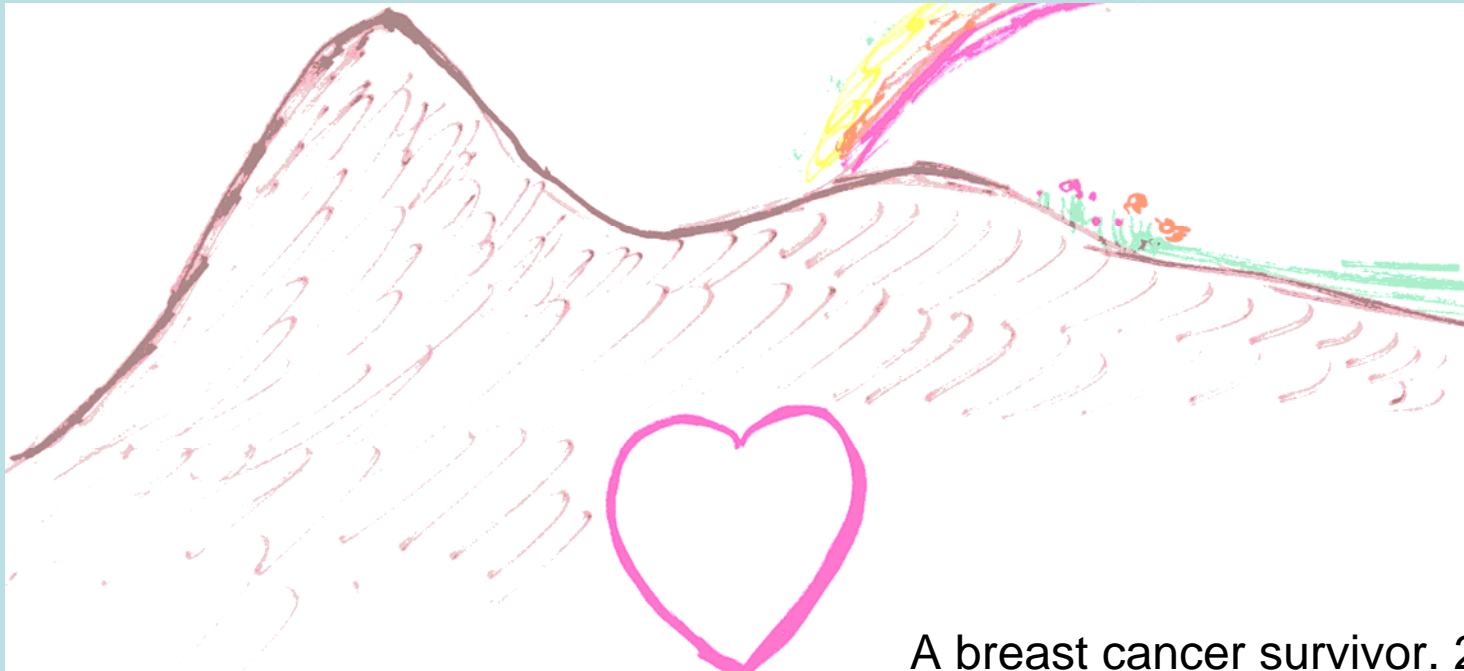
A breast cancer survivor. 2002.